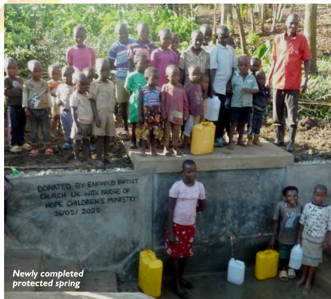
Newly completed protected spring