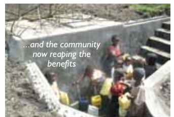
...and the community now reaping the benefits