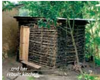
...and her rebuilt kitchen

In May 2010 Bridge of Hope Children's Ministry started an Income Generating Activity (IGA) and several families received female goats to breed. Goats are very important to the cultural traditions and economic success of the region and the breeding programme