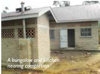
A bungalow and kitchen nearing completion

Dear friends, it is a privilege to update you on the work of Bridge of Hope Children's Ministry . In May 2011 a team of nine visited Uganda to witness the amazing construction progress on the two bungalows, the kitchens, pit latrine and the installation of the rain water harvesters.