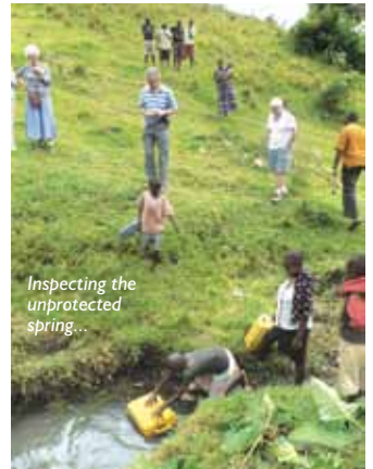
Inspecting the unprotected spring...