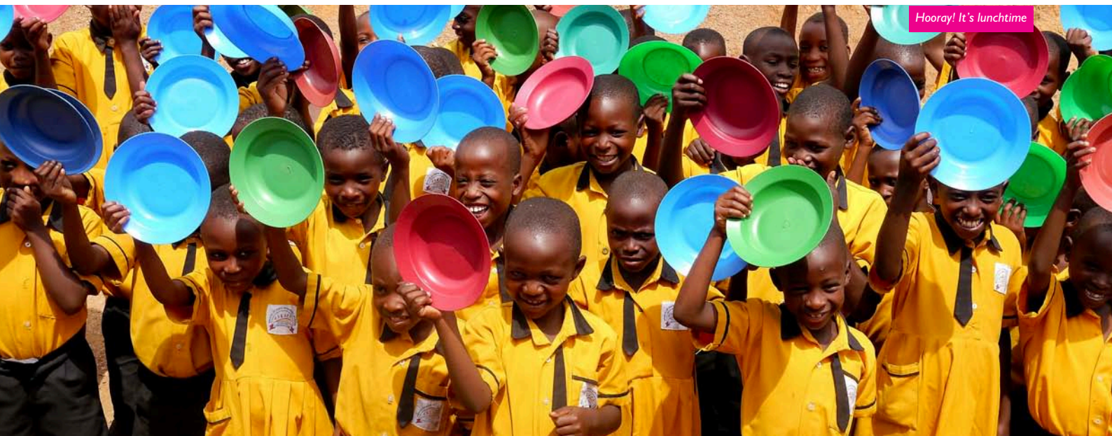
Hooray! It's lunchtime