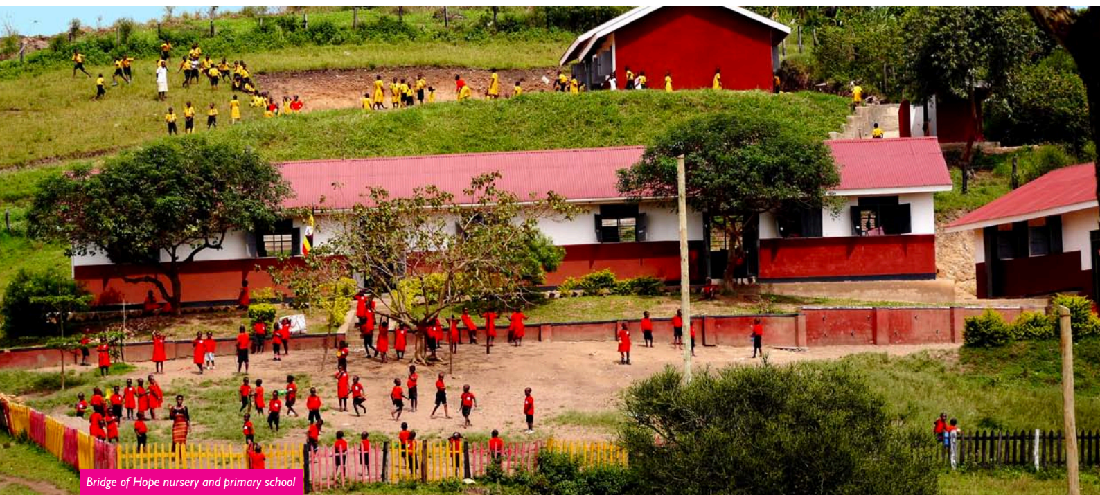
Bridge of Hope nursery and primary school

It is your support that enables us to expand the school, give free meals to the children and provide bursaries to those affected by poverty.