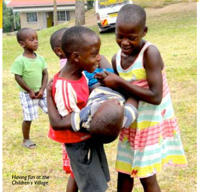
Having fun at the Children's Village

good grades and has returned to his much loved Boarding School to start his second year.