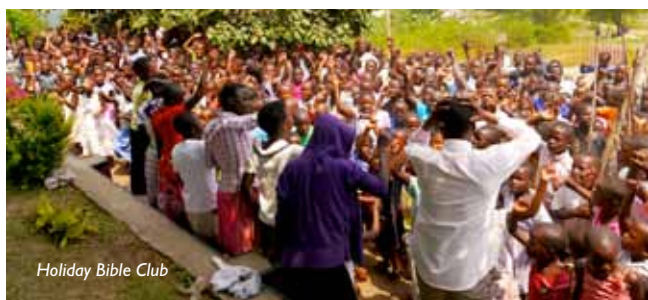
Holiday Bible Club

Welcome to the first BOHCM newsletter of 2015 and we extend a very big thank you for your generous prayerful and financial support over the past year.