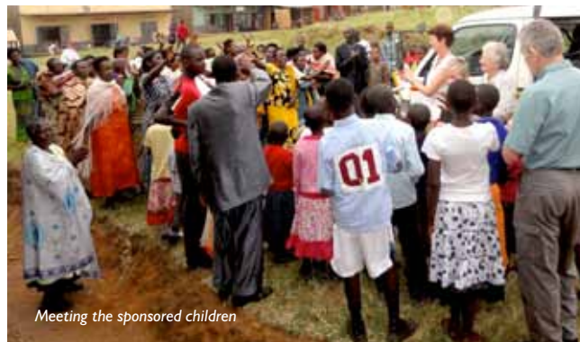
Meeting the sponsored children

Our Child Sponsorship Scheme now supports 147 children. Currently four of these children do not have